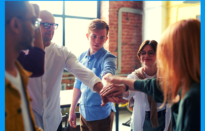
Registered After School Program