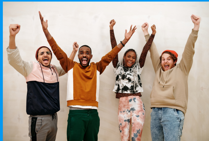
Workshops on Demand